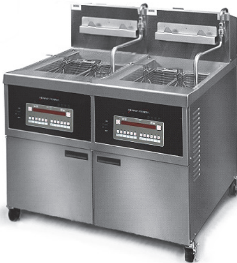
OFE 342 2-well large capacity electric open fryer with Computron™ 8000 control

OFE 341 1-well electric OFE 342 2-well electric