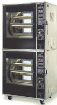
SCR 12 stacked 12-spit rotisserie

The sight, smell and taste of rotisserie chicken can add significant impact and sales to your store. With such a powerful appeal to the senses, choosing your equipment is critical.