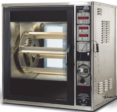
SCR 6 countertop 6-spit rotisserie

SCR 6 6-spit Countertop SCR 12 12-spit Stacked